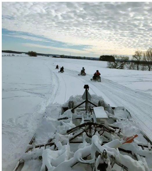
Riders enjoy a freshly groomed trail, taking in scenery unseen from the road.

Another issue many clubs currently face is property transfers. Larger parcels may be divided and sold to several new owners. A trail that was used for years suddenly becomes unusable if the new property owner decides that they do not wish to grant trail access on their property. While this decision ultimately lies with the property owner, they are encouraged