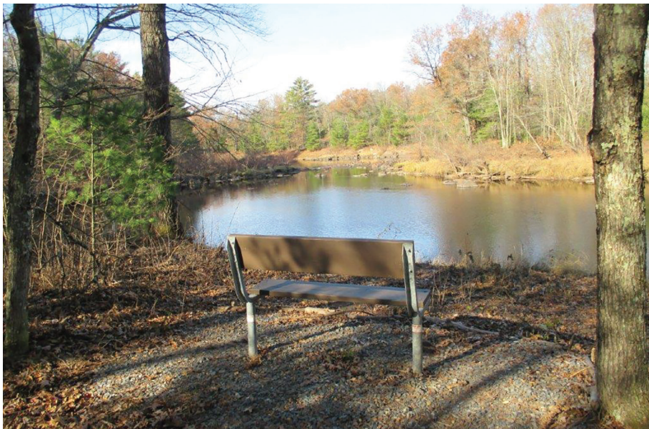
East Fork offers canoe access and nature trails with scenic views.

published a book in 1959 about their discoveries. The S-shape zone runs from the northwestern part of the state in Burnett County to the southeast corner of the state, ending in Racine County. Above the zone is the Northern Mesic Forest, below it, the Southern Broadleaf Forest. “Within this zone, you’ll find a combination of species representing both forest types,” explains Peter.