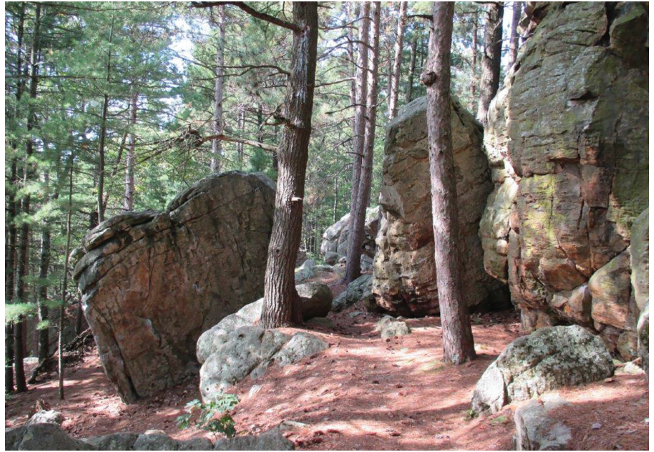
Castle Mound is a great starting point for first-time visitors to the Black River State Forest.

Black River State Forest offers over 69,000 acres of recreational opportunity