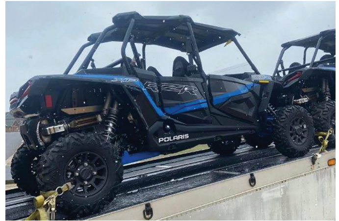
Left: A RZR at the Black River Falls location waits for you to jump in and take an adventure.