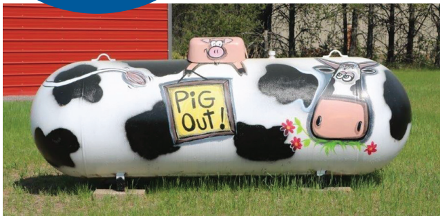
Even the LP tank says it's okay to "Pig Out!" at Leroy's.

If you're getting the taste for BBQ while reading this article, Leroy's Grill is open Wednesday through Saturday, 10:30 a.m. to 6:30 p.m. Visit @Leroy's Grill on Facebook for a list of menu items, specials, and updates.