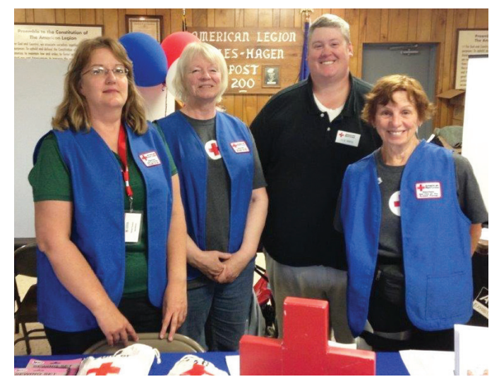
Local volunteers offer support at a Veterans Expo/Stand Down event at the Black River Falls American Legion.

opportunities in our area, and that it moves you to give a little bit of your time and talent back to your community. All the best in 2019!