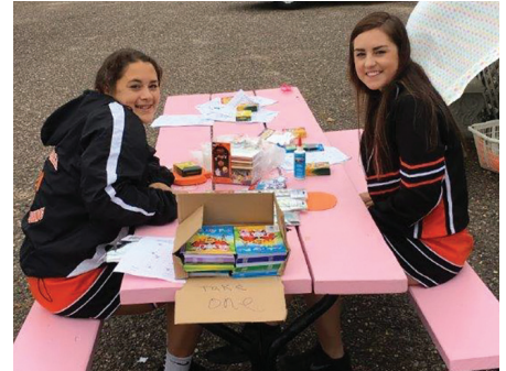
Fun Fair offers a variety of games, activities and prizes for attendees.