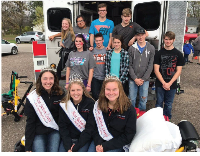
The Fun Fair brings volunteers and the community together for a family-focused day in October.

BRH advocates are there to provide supportive listening, legal advocacy, children's advocacy, court accompaniment,